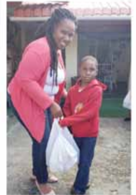
Giving back to the Community December 2019

credit union and where do youths see themselves in the credit union movement).