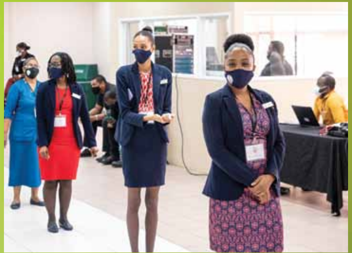
Members cordially lining up to vote.