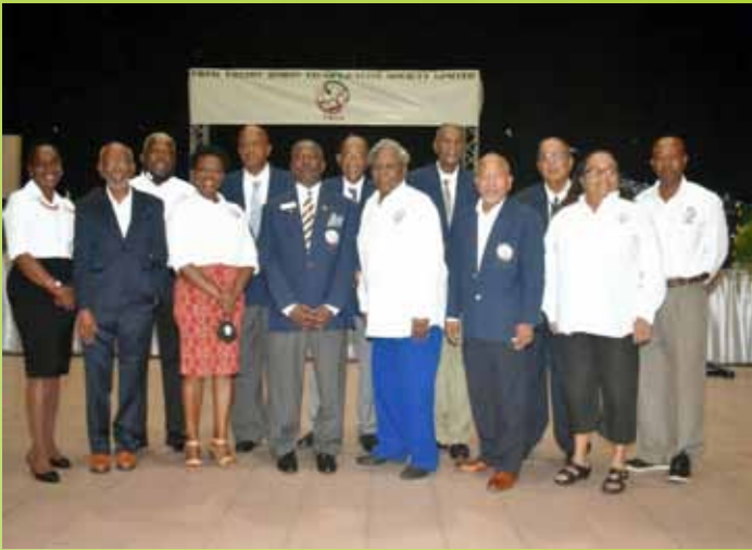
Executives, Board and Committee members .