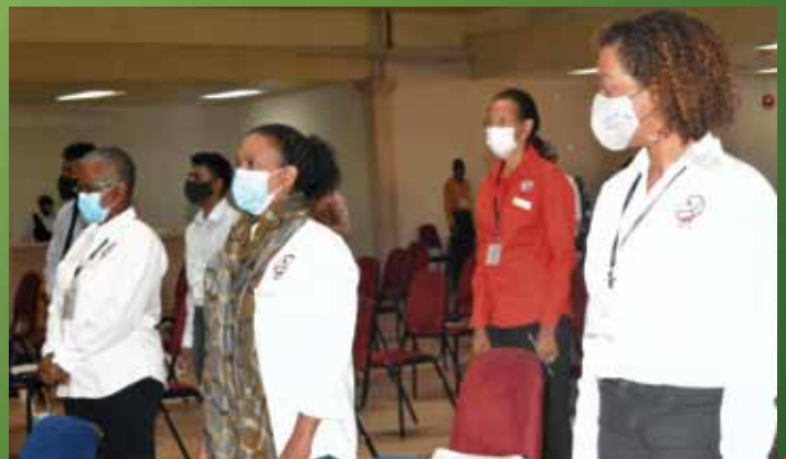
Cross section of the audience at the AGM.