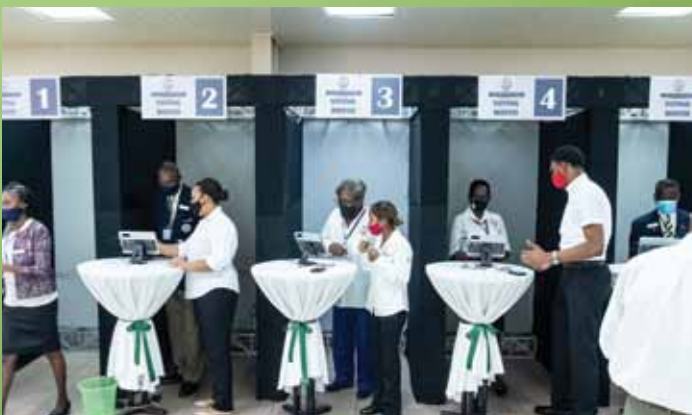
Members at the polling stations.